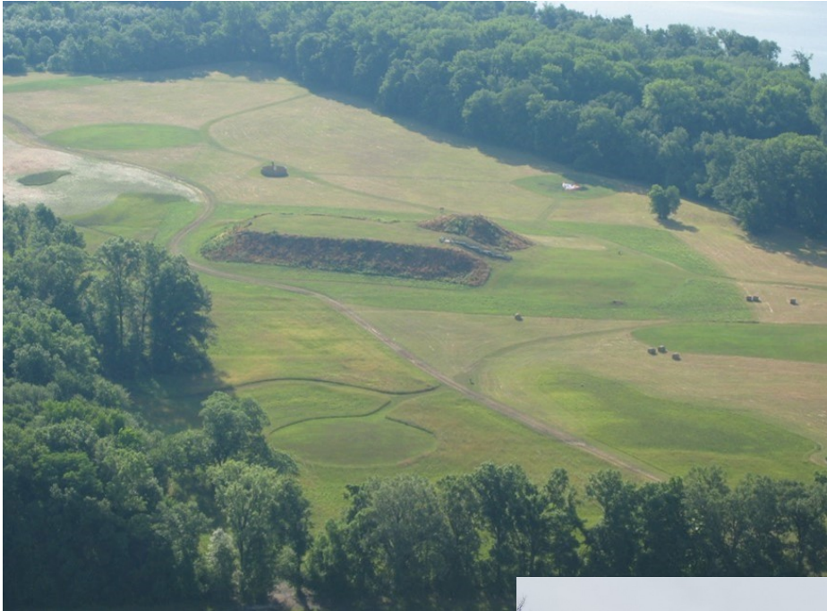
Ariel view of the Angel Mounds

The east village portion of the site where the majority of the occupation occurred