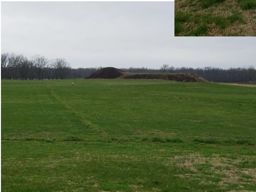
Ground view of mound A which was thought to be used for ceremonial